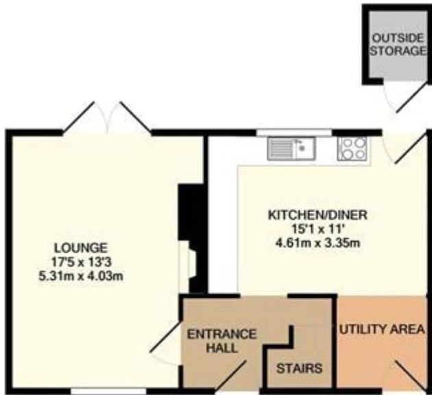
GROUND FLOOR APPROX. FLOOR AREA 509 SQ.FT. (47.2 SQ.M.)