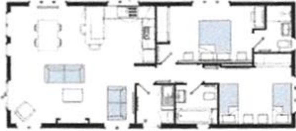
45' x 20' 2 Bed